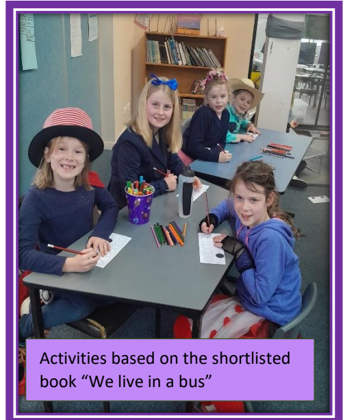
Activities based on the shortlisted book "We live in a bus"

"The science experiments kept students engaged, and the unexpected outcomes led to genuine curiosity and interest."